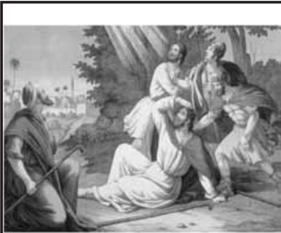
Conversion of St. Paul – January 25th

Parish Office Hours—Monday through Friday—9:00am to 4:00pm